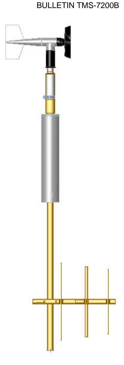
TMS-7200 Weather Sensor, (Yagi antenna below)