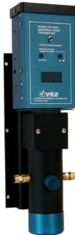
DPT-2011 Single Stage Dew Point Transmitter