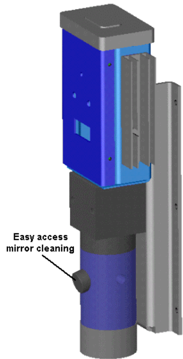
DPT-2011 showing access location for mirror cleaning